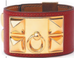
Hermès “Collier de Chien” cuff in Rouge Hermès, the first color the company used on handbags and its signature leather color — not orange.

“The Royal Tenenbaums, Amélie, In the Mood for Love (in every scene she has the same cut dress but in different fabric patterns and colors), Blue Velvet, Henry and June, all of The Pink Panther films (so funny) and, of course, all of the James Bond movies.”