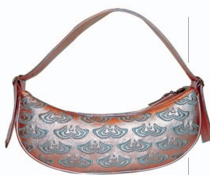
Garrigue & Jarossay metallic evening bag, $360, from a collection at Premium 93 and Studio Sebastian; Kirma Zabête, New York; or www.garriguejarossay.com