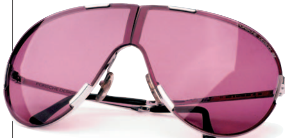
“I’m never without sunglasses. This Porsche pair belonged to my mother.”