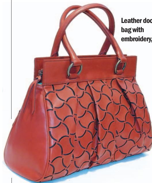
Leather doctor bag with embroidery, $500

3 Go for quality instead of quantity. Don’t do knockoffs or imitations, buy the original. Recognize which companies are good at making certain types of products, and what their specialties are.