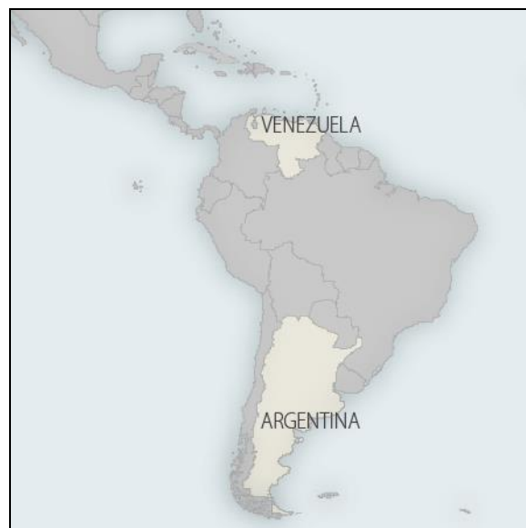
Figure 4. Latin America

Some U.S. officials and some in Congress have expressed concerns about Iran's relations with leaders in Latin America that share Iran's distrust of the United States. Some experts and U.S. officials have asserted that Iran has sought to position IRGC-QF operatives and Hezbollah members in Latin America to potentially carry out terrorist attacks against Israeli targets in the region or even in the United States itself. 142 Some U.S. officials have asserted that Iran and Hezbollah's activities in Latin America include money laundering and trafficking in drugs and counterfeit goods. 143 These concerns were heightened during the presidency of Mahmoud Ahmadinejad (2005-2013), who made repeated, high-profile visits to the region in an effort to circumvent U.S. sanctions and gain support for his criticisms of U.S. policies. However, few of the economic agreements that Ahmadinejad announced with Latin American countries were implemented, by all accounts.