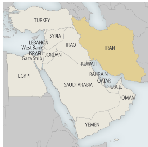
Figure 1. Map of Near East

The following sections analyze the main outlines of Iran's policy toward each GCC state. There are distinct differences within the GCC on Iran policy, as discussed below.